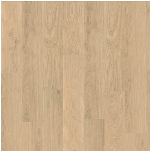
OAK FALUN wider shot

Interior laminate floor, with a slat with a thickness of 7 mm, 1, with a “click” joint system. The uniform defined decoration will be used in the whole apartment except for the bathroom, and toilet and except for the entrance door of the apartments situated on the 1. st above-ground floor, where the pavement is designed. The exact type of product, manufacturer, and decor will be selected after the selection of supplier, before defining the standard equipment of the apartment. Part of the floor is a white floor skirting board and transition rails made of anodized aluminum.